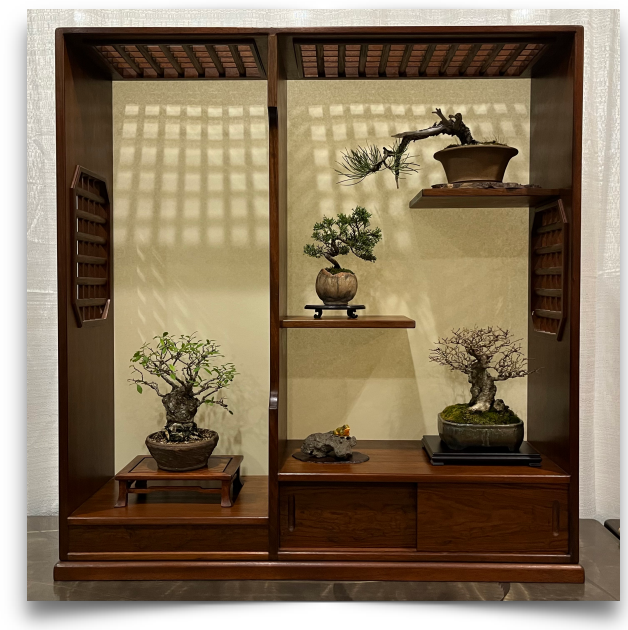
Our club shohin display at the 2023 MABS Spring Festival

The club exhibit area displays trees from each MABS affiliate club, with each club asked to display three to four items. As we did last year, in addition to stand-alone trees, our club display will include our shohin